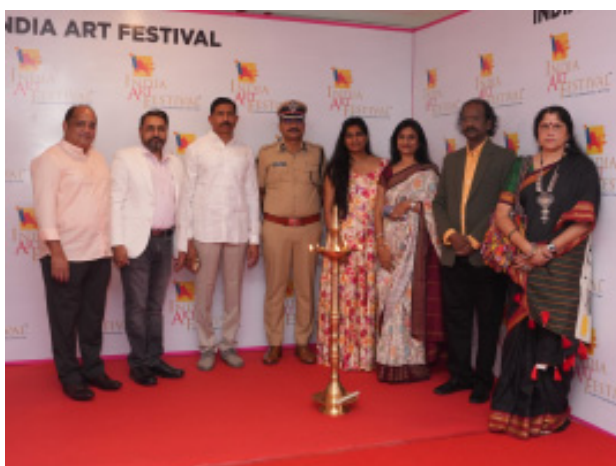
press note "India Art Festival Hyderabad kicked off on Friday at the Jubilee Hills Convention Centre, bringing together a vibrant mix of art enthusiasts, artists, curators, and writers under one roof. The much-anticipated three-day art