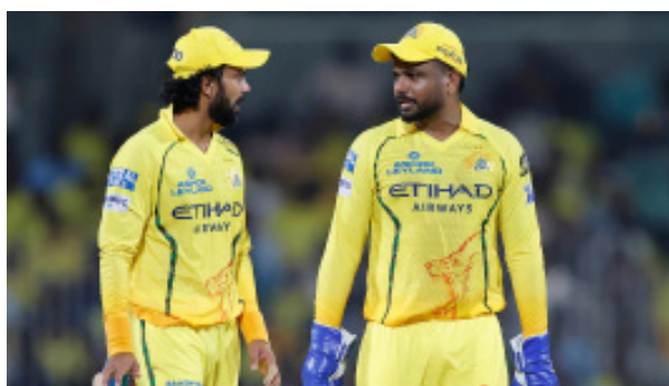
April 4

Ruturaj Gaikwad’s captaincy has come under scrutiny at the Chennai Super Kings after successive defeats at the start of their IPL 2026 campaign. While former CSK batter S Badrinath openly criticised Gaikwad’s tactics, other pundits feel the presence of Sanju Samson will challenge Gaikwad’s security as a leader this season. Despite scoring 209 in their first home game of the season against the Punjab Kings on Friday night, CSK suffered a crushing defeat, compounding Gaikwad’s woes as captain. With Samson emerging as the preferred choice to succeed MS Dhoni as CSK’s next wicket-keeping talisman, Gaikwad will feel the heat, according to pundits Michael Vaughan and Simon Doull. In a chat with former England captain Vaughan, Doull was asked whether Samson’s presence would affect Gaikwad’s leadership. “Absolutely threatened” “What about the captain, Gaikwad? Do you think he feels threatened [by Samson]?” Vaughan asked the former New Zealand seamer on Cricbuzz. Vaughan too observed that Gaikwad will face ample pressure in Samson’s presence. Despite the poor start to his captaincy tenure, Gaikwad continues to find the