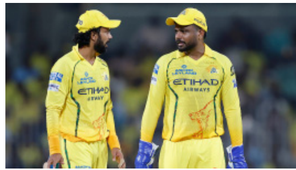
April 4

Ruturaj Gaikwad’s captaincy has come under scrutiny at the Chennai Super Kings after successive defeats at the start of their IPL 2026 campaign. While former CSK batter S Badrinath openly criticised Gaikwad’s tactics, other pundits feel the presence of Sanju Samson will challenge Gaikwad’s security as a leader this season. Despite scoring 209 in their first home game of the season against the Punjab Kings on Friday night, CSK suffered a crushing defeat, compounding Gaikwad’s woes as captain. With Samson emerging as the preferred choice to succeed MS Dhoni as CSK’s next wicket-keeping talisman, Gaikwad will feel the heat, according to pundits Michael Vaughan and Simon Doull. In a chat with former England captain Vaughan, Doull was asked whether Samson’s presence would affect Gaikwad’s leadership. “Absolutely threatened” “What about the captain, Gaikwad? Do you think he feels threatened [by Samson]?” Vaughan asked the former New Zealand seamer on Cricbuzz. Vaughan too observed that Gaikwad will face ample pressure in Samson’s presence. Despite the poor start to his captaincy tenure, Gaikwad continues to find the