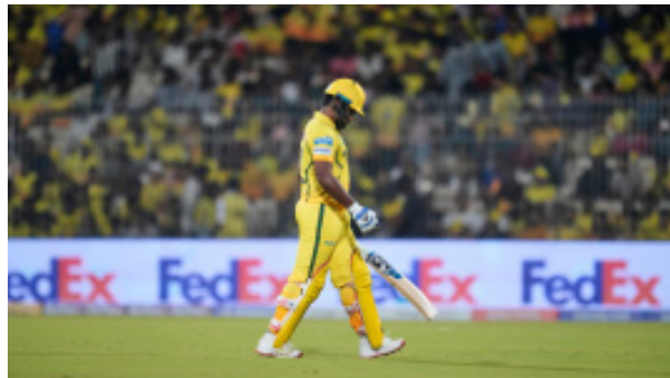
April 4