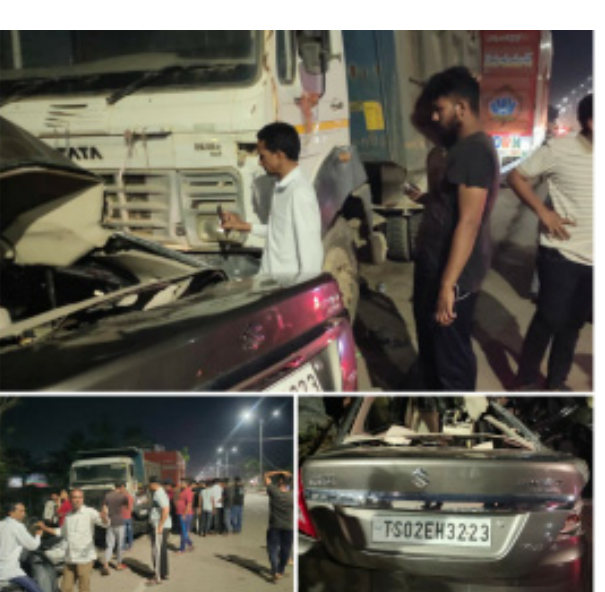
Speeding vehicle crashes into roadside truck near Bommakal flyover; two injured, one critical.