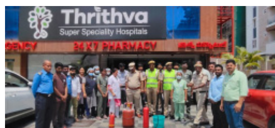
Fire Station Cherlapally, along with his team.

“MEDCHAL- MALKAJGIRI, Staff Reporter, April 17 (INDIAN CHRONICLE): KEESARA: As part of Fire Service Week, an awareness program on fire safety was conducted on Friday at Trithva and Bhaskar Neuro Care hospitals in Kapra