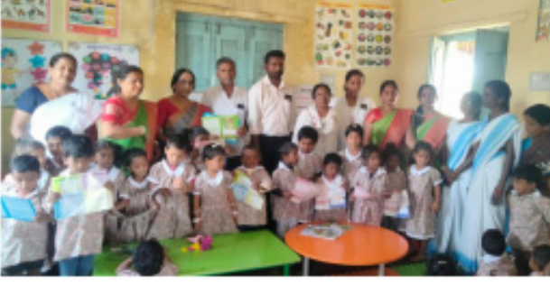
A large number of parents and children attended the programme.