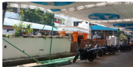
emony of Sita Ramachandra.