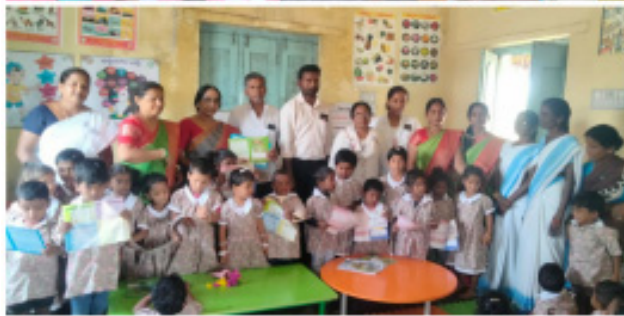
A large number of parents and children attended the programme.