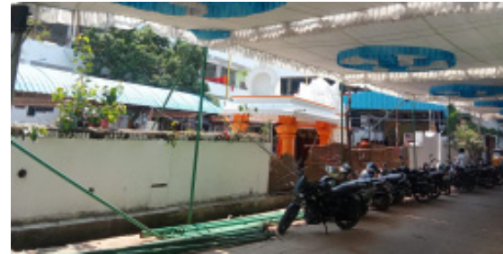
emony of Sita Ramachandra.