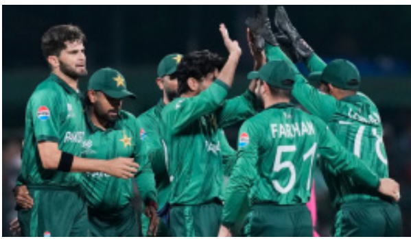
March 16

Bangladesh won the third and deciding ODI on Sunday to take the friendship series 2-1, completing a miserable tour for Pakistan who had already lost the preceding Test series 2-0. "If you want to win a series at home, just invite Pakistan," said Basit Ali on his YouTube channel, the BasitAliShow.