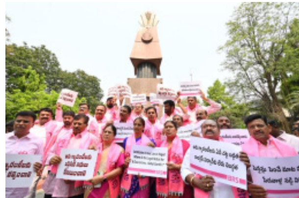
these slogans, BRS leaders voiced their opposition and criticized the government's policies.