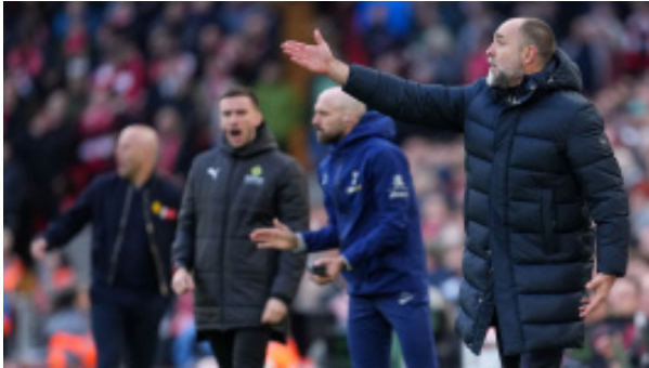
March 16

It may not have got them out of the relegation scrap that they find themselves in but Tottenham Hotspur finally earned their first point under current manager Igor Tudor. Their Premier League match against Liverpool away from home finished 1-1, thus making it the first match that they hadn't lost under the Croatian manager since he took over from Thomas Frank last month. Before the match began, though, Tudor inadvertently ensured that referee Paul Tierney awkwardly standing in the middle of the Chelsea huddle won't be the only viral moment of the Premier League weekend.