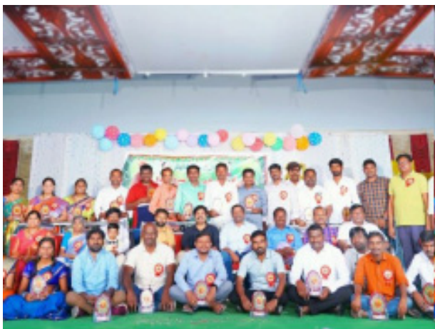
పూర్వ విద్యార్థుల ఆత్మీయ సమ్మేళనం వివేకానంద విద్యామందిర్ - మోక్షూర్ SSC 2002-2003