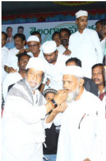
Sangareddy Indian Chronicle Correspondent March 14,...