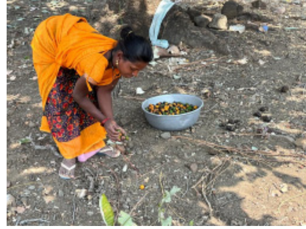
trees vanished from the jungles thanks to illegal forest decimation.

S. Harpal Singh, Adilabad, March 12 "The arrival of spring season in Adilabad is accompanied with a cold reminder of the gradual loss of nature. The summer months used to be known for the abundance of wild flowers as well as wild fruits. "Fruits like tuniki pandu or tendu fruit (Diospyros melanoxylon) will be extinct in the coming years in case the remaining trees are spared the axe. Umindful felling of trees to expand agriculture fields on the forest fringes has spelt doom for the species. "The adivasis of Adilabad too have stood to lose as the fruit used to earn them precious supplemental income during the dry months. Local tribal women who used to bring the fruit to markets in Adilabad are not seen anymore. "The tuniki fruit is generally identified with sapodilla or chiku or sapota as its pulp of both the trees have similar taste. It, however, is smaller than the sapota and has a yellow and rather hard covering. "Until a couple of decades back the tendu tree was an important species which was part of the thick forests in Adilabad and Kumram Bheem Asifabad districts. Over this period, hundreds, if not thousands, of