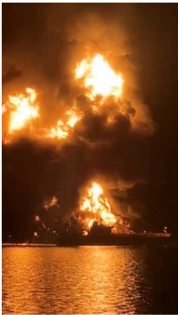
ens across West Asia, with Iran signalling that it is prepared for a prolonged confrontation while continuing to leverage both military retaliation and economic pressure, including the threat to disrupt global oil supplies through the Strait of Hormuz.

Khamenei's first message as Supreme Leader underscores Tehran's hardening stance as the conflict wid-