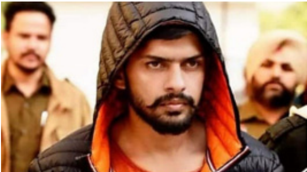
GNS News Agency, Feb 18

The gang's social media presence consists of “fan accounts” that upload reels featuring its members projecting a sense of “swag,” at times even from court premises. The gang's social media presence consists of “fan accounts” that upload reels featuring its members projecting a sense of “swag,” at times even from court premises.