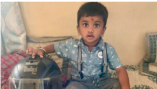
GNS News Agency, Feb 18

Due to the impact, the child fell onto the road, and the car reportedly ran over him, causing grievous injuries. Due to the impact, the child fell onto the road, and the car reportedly ran over him, causing grievous injuries. A two-year-old boy was killed after a speeding car allegedly rammed into a scooter and ran over him in Bengaluru's KR Puram Sunday evening, triggering protests by residents who blamed poor road conditions and traffic mismanagement for the accident.