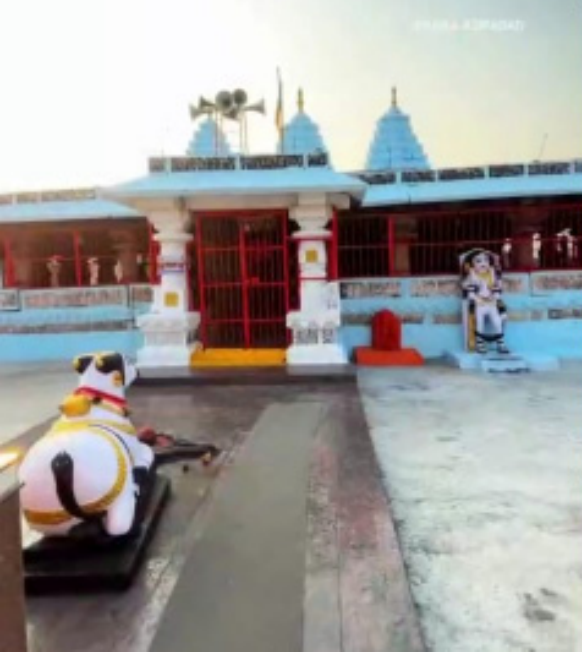
Temple of Wankidi remains an important historical and spiritual landmark, proudly preserving the legacy of the Kakatiya era."[6:55 PM, 2/14/2026] +91 99485 55073: End...