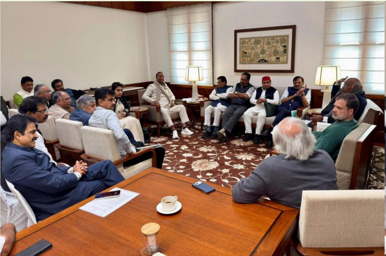
Speaker was taken earlier today during a meeting at the residence of Congress chief Mallikarjun Kharge. Meanwhile, Rahul, Abhishek Banerjee (TMC), Akhilesh Yadav (SP) and TR Baalu (DMK) met Birla to find a solution. Rahul is learnt to have told the Speaker that he wanted to talk about the suspension of eight Opposition MPs, as also remarks made against women MPs. The leaders also urged the Speaker to revoke the MPs' suspension. After meeting Birla, Rahul said outside Parliament that PM Narendra Modi did not come to the Lok Sabha on February 4 as he was "scared of the contents of Gen Naravane (ret'd)'s memoirs". "Those claiming there was a threat to the PM from women MPs should register an FIR," he said.