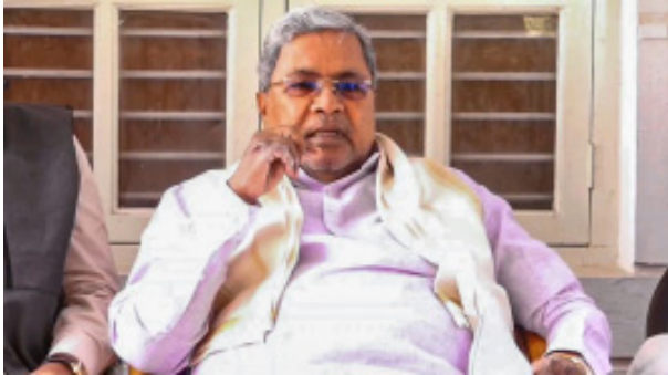
GNS News Agency, Feb 9

Following up on a decision to revert from EVMs to ballot papers for local polls, the Karnataka government has decided to introduce a bill in the forthcoming budget session of the legislature to facilitate the reversion. A meeting of the state cabinet this week approved the introduction of the Karnataka Gram Swaraj and Panchayat Raj (Amendment) Bill, 2026, to do away with EVMs for local polls in villages and to revert to the older system of casting votes on ballot papers.