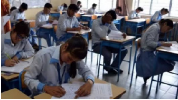
GNS News Agency, Feb 9

The West Bengal Board of Secondary Education (WBBSE) stated that 13 candidates have been barred from taking the Madhyamik (Class 10 Board) examination after being caught with mobile phones inside examination halls on Friday. Among those 13 candidates, four each were from Kolkata and Kalimpong, while two were from Cooch Behar, and one each from Jalpaiguri, Malda, and East Burdwan districts. A WBBSE official said, “Records show multiple candidates from the same schools being caught at particular venues.”