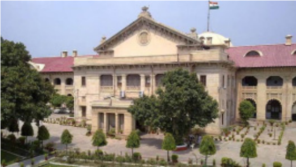
Oct 15

The Allahabad High Court has directed the Uttar Pradesh Director General of Police (DGP) that police officials not disclosing the grounds of arrest to the accused in the prescribed document while making the arrest should be dealt strictly and shall face a departmental inquiry after suspension to stop them indulging in such “illegality”.