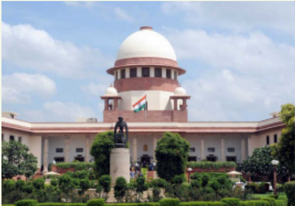
children were denied admission in 2016 to a neighbourhood school for free and compulsory elementary education despite the availability of seats. The

The order came on a petition filed by a man whose