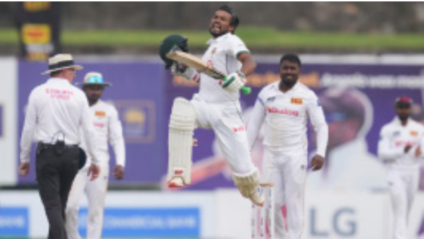
GNS News Agency, Jan 13