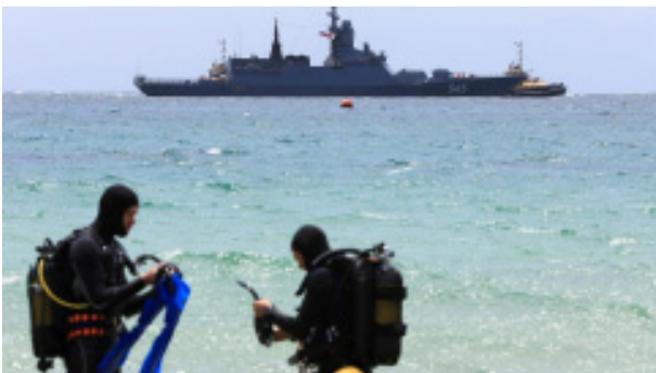
GNS News Agency, Jan 13

China, Russia and Iran began a week of joint naval exercises in South Africa’s waters on Saturday (January 10, 2026) in what the host country described as a BRICS Plus operation to “ensure the safety of shipping and maritime economic activities”. BRICS Plus is an expansion of a geopolitical bloc originally comprising Brazil, Russia, India, China and South Africa – and seen by members as a counterweight to U.S. and Western economic dominance – to include six other countries. Though South Africa routinely carries out naval exercises with China and Russia, it comes at a time of heightened tensions between U.S. President Donald Trump’s administration and several BRICS Plus countries, including China, Iran, South Africa and Brazil. The expanded BRICS group also includes Egypt, Indonesia, Saudi Arabia, Ethiopia and the United Arab Emirates. Chinese military officials leading the opening ceremony said Brazil, Egypt and Ethiopia participated as observers. “Exercise WILL FOR PEACE 2026 brings together navies from BRICS Plus countries for ... joint maritime safety operations (and) interoperability drills,” South Africa’s military said in a statement. Lieutenant Colonel Mpho Mathebula, acting spokesperson for joint operations, told