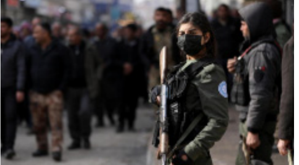
GNS News Agency, Jan 13

Syrian authorities warned civilians to leave a contested area in the northern city of Aleppo on Thursday (January 8, 2026) and opened a corridor for them to evacuate for a second day as clashes continued between government and Kurdish forces. The government of Aleppo province gave residents until 1 p.m. local time to evacuate in coordination with the army. State news agency SANA, citing the army, said the military would begin “targeted operations” against the Kurdish-led Syrian Democratic Forces in the neighbourhoods of Sheikh Maqsood, Achrafieh and Bani Zaid half an hour after that deadline.