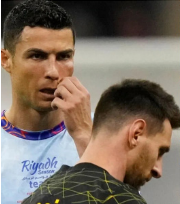
GNS News Agency, Jan 4

India have a golden opportunity in their hands to match what West Indies did in the 1970s, and Australia did in the 2000s; Cristiano Ronaldo and Lionel Messi will be giving what could be their final push for a FIFA World CupIndia have a golden opportunity in their hands to match what West Indies did in the 1970s, and Australia did in the 2000s; Cristiano Ronaldo and Lionel Messi will be giving what could be their final push for a FIFA World Cup