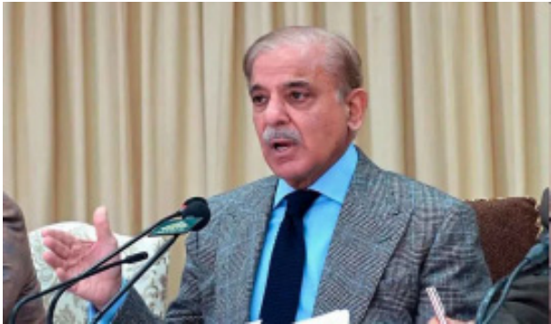
Jan 4

Islamabad: Prime Minister Shehbaz Sharif has launched economic-governance reforms to address the vulnerabilities identified in the International Monetary Fund’s (IMF) Governance and Corruption report. The 186-page Governance and Corruption Diagnostic report launched late last year highlighted massive economic leakages due to bad governance and corruption.