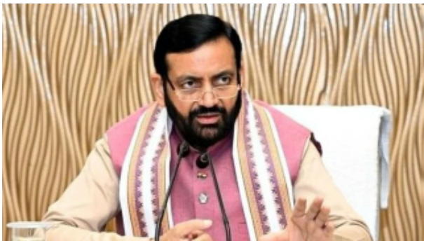
GNS News Agency, Jan 4