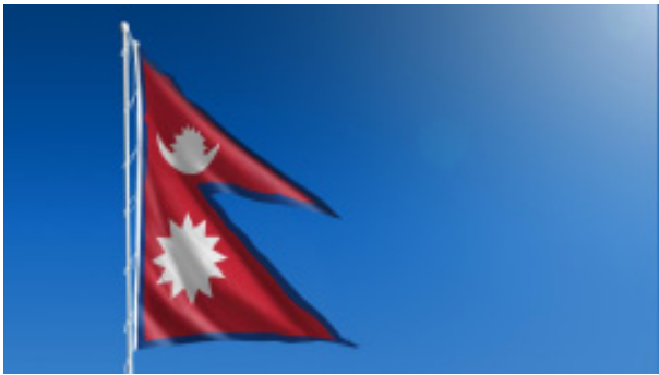
Jan 17