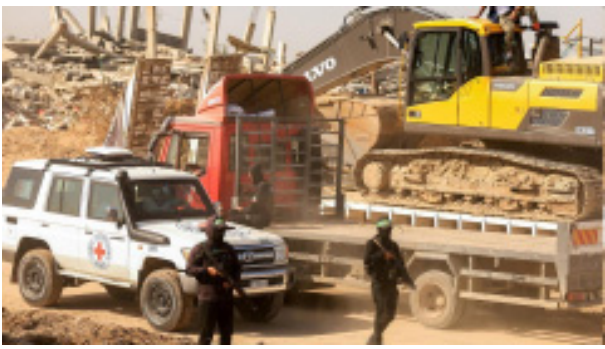
GNS News Agency, Jan 17

Israeli airstrikes killed four people and wounded 18 others in Khan Younis in the southern Gaza Strip on Thursday, local health authorities said, as Hamas and Israel accused each other of violating a near six-week-old, U.S.-brokered ceasefire. Medics said that one strike on a house in Bani Suhaila town, east of Khan Younis, killed three people, including a baby girl, and wounded 15 others, while another killed a man and wounded three others in the nearby Abassan town. Israel's military confirmed the strikes but said it was not aware of casualties. On Wednesday (November 19), Israel said it struck targets across the enclave after members of the Palestinian militant group fired on its troops, and Gaza medics said at least 25 people were killed. Hamas called the attacks a dangerous escalation and urged Arab mediators, Turkey and the United States to intervene. Ceasefire eases conflict but attack continuesIn Gaza City's Zeitoun suburb, where