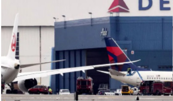
Jan 17

Seattle: Washington state's governor declared an emergency on Wednesday to ensure enough jet fuel gets to Seattle-Tacoma International Airport after a leak shut down a major fuel pipeline. The order temporarily waives and suspends state regulations limiting the number of hours commercial vehicle operators can drive when transporting jet fuel, Gov. Bob Ferguson's office said in a news release.