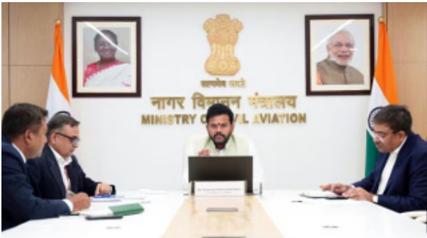
GNS News Agency, Dec 6

DGCA FDTL rules: Union Minister of Civil Aviation Kinjarapu Ram Mohan Naidu discusses the ongoing disruptions caused by the delays and cancellations of IndiGo flights, in New Delhi on Friday.DGCA FDTL rules: Union Minister of Civil Aviation Kinjarapu Ram Mohan Naidu discusses the ongoing disruptions caused by the delays and cancellations of IndiGo flights, in New Delhi on Friday. IndiGo flight cancellations: Union Civil Aviation Minister Ram Mohan Naidu has warned that an inquiry has been launched into the IndiGo flights fiasco and those responsible will “pay for it.” He said the Centre’s inquiry committee will submit its findings on the IndiGo flight disruptions, after which appropriate action will be taken.