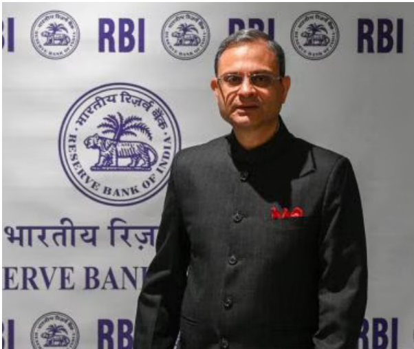
GNS News Agency, Dec 6

Even as the rupee depreciated by over 5 per cent to beyond 90 against the dollar, Reserve Bank of India (RBI) Governor Sanjay Malhotra on Friday said the central bank was well placed on the currency front. “This volatility does happen, can happen,” he said, adding that the market is very “efficient” and “deep”.After cutting the repo rates by 25 basis points (bps) to 5.25 per cent on Friday, Malhotra said, “we allow the markets to determine, I mean, we don’t target you any price levels or any bands.”