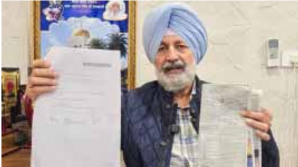
GNS News Agency, Dec 27