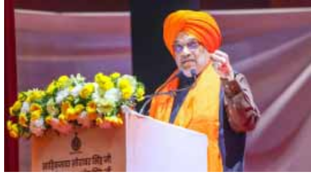
GNS News Agency, Dec 27

Union Home Minister Amit Shah Wednesday laid out an ambitious roadmap positioning Haryana as a national model for farmer welfare, cooperative-driven growth, and administrative reform. Shah also announced a series of major initiatives ranging from infrastructure projects and digital platforms to sweeping agricultural and cooperative reforms at the cooperative conference in Panchkula, Wednesday. The event underscored the Centre and state government’s shared focus on “Sahkar se Samridhhi” – prosperity through cooperation – while also addressing challenges of internal security, rural livelihoods, and sustainable agriculture.