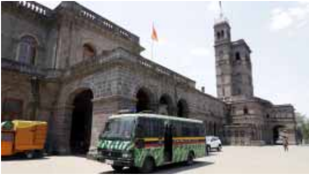
GNS News Agency, Dec 27

The Department of Microbiology at Savitribai Phule Pune University (SPPU) will conduct a three-day awareness programme for students from February 3 on the issue of antimicrobial resistance, caused by the misuse and improper use of antibiotics. The programme will include various activities and competitions, including expert talks, science-based plays, campus awareness marches, radio podcasts, oral presentations by PhD scholars, poster presentations by postgraduate scholars, and a quiz for undergraduate scholars.