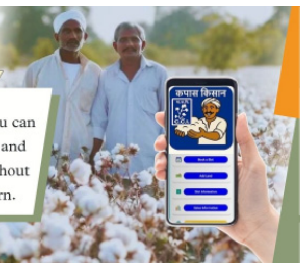
exceeding this limit will not be accepted, he clarified."Farmers have been advised to take note of this revised rule and accurately enter the quantity while booking slots on the Kapas Kisan App to avoid inconvenience."Issued by the District Public Relations Officer, Kumram Bheem-Asifabad district.