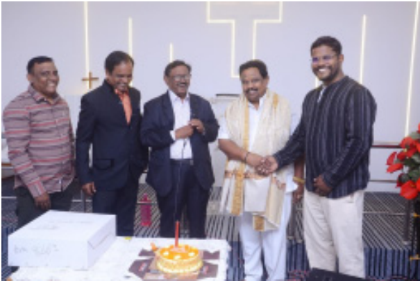
Secunderabad Cantonment. December 25 (Indian Chronicle): "Christmas celebrations were held grandly in Bowenpally under Cantonment Board on Thursday. Christians offered special prayers at Bapuji Nagar Baptist Church, Shivalayam street Faith One Church, Penta