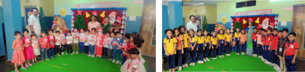
“(KISHORE VADDEPALLI, Uppal, December 25 (Indian Chronicle)“(Christmas celebrations were held in a grand manner at Chaitanya Bharathi High School, located in Ganesh Nagar, Uppal. Students actively participated in the festivities by singing various Christmas songs and captivating everyone with their performances in dif-

ferent festive costumes.”“(The joyful celebrations created a vibrant and cheerful atmosphere across the school campus. Students enthusiastically showcased their talents, spreading the message of love, peace, and harmony associated with the Christmas festival.”“(The program was attended by the school Correspondent and Principal, Vemulakonda Venkanna Goud, Vice Principal Shobha Goud, colony elders, parents of the students, teaching and non-teaching staff, and students,