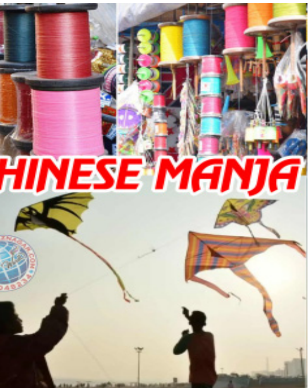
Taj Khan, Kaghaznagar, December 25 (Indian Chronicle)"District Superintendent of Police Nitika Pant has warned that Chinese manja, made of nylon or synthetic thread coated with glass powder, is extremely dangerous and poses a serious threat to motorists and pedestrians."She said that while riding at high speeds, especially on two-wheelers, if the thread comes in contact with the neck or face, it can cause severe injuries and profuse bleeding, potentially leading to loss of life. As the thread is very thin, it often remains invisible while hanging in the air, increasing the risk of accidents."The SP advised motorists to wear helmets with full face-covering windshields and to reduce speed while passing through flyovers and areas where kite flying is common."She further cautioned that the sale, transport, and use of Chinese manja is a punishable offence under the Environment Protection Act and the Bharatiya Nyaya Sanhita (BNS). Offenders may face heavy fines and imprisonment of up to seven years."The District SP urged the public to immediately inform the police, either directly or by dialing 100, if they come across any information related to the sale or transportation of Chinese manja.