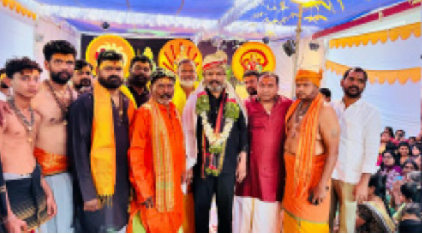
Secunderabad Cantonment. December 25 (Indian Chronicle): "Ayyappa Padipujas were held in grandeur at New Bowenpally Hanuman Cooperative Society Ayyappa Swamy Temple and Mudford Tulkantamman temples in Cantonment Constituency on Thursday. These celebrations include 18-step pooja and palanquin