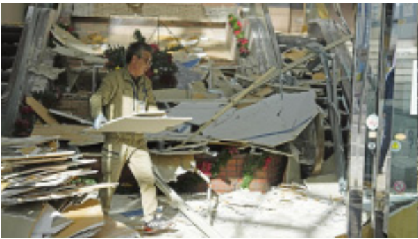
GNS News Agency, Dec 10

Japan was assessing damages on Tuesday (December 9, 2025) and cautioning people of potential aftershocks after a late-night 7.5 magnitude earthquake caused injuries, light damage and a tsunami in Pacific coastal communities. At least 33 people were injured, one seriously, the Fire and Disaster Management Agency said. Most of them were hit by falling objects, public broadcaster NHK reported.