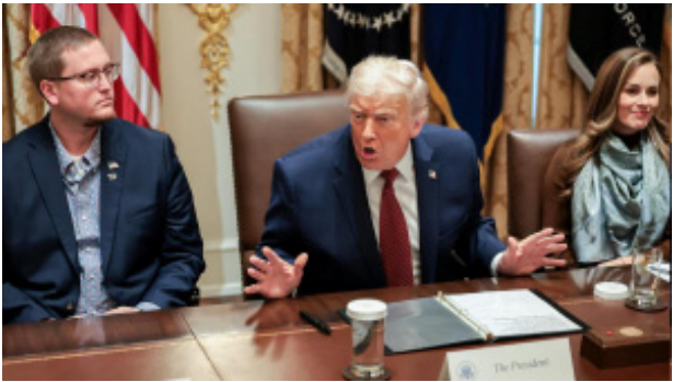
GNS News Agency, Dec 10

Days before a U.S. team of negotiators is to visit India to discuss tariffs, U.S. President Donald Trump has hinted that he might hit India with further tariffs, this time on rice, to prevent it from "dumping" rice in the U.S. However, an analysis of trade data between the two countries shows that such tariffs would hurt the U.S. far more than India, since the U.S. makes up about 3% of India's total rice exports, whereas Indian rice comprises more than one-fourth of the rice imported into the U.S.