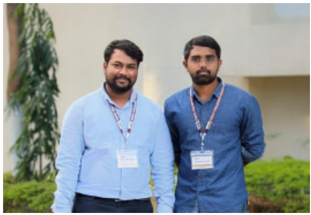
Hyderabad Swatantrata Center, a public policy think tank work-