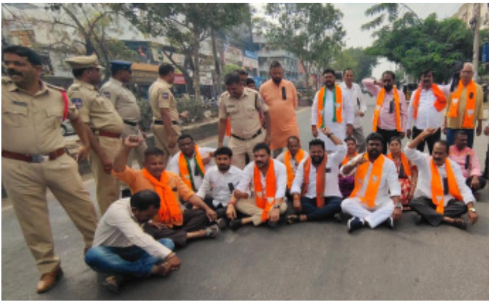
condemning the inappropriate comments made by Telangana CM Revanth Reddy on Hindus and Hindu

“Indian Chronicle OU December 03: A protest program was organized under the auspices of the Nacharam Division Bharatiya Janata Party,