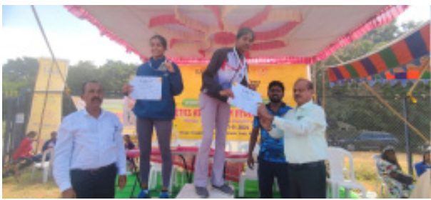
""Indian Chronicle OU November 21: Asmita League-2025 was organized as part of Khelo India on Friday at the synthetic track of Osmania University under the auspices of Hyderabad District Athletics Association. About 200 players from 20 colleges and schools in Hyderabad city participated in this. Long jump, javelin throw and running compe-