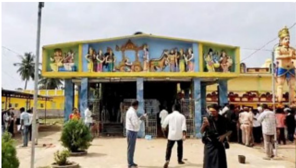
GNS News Agency, Nov 14