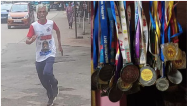
Nov 14