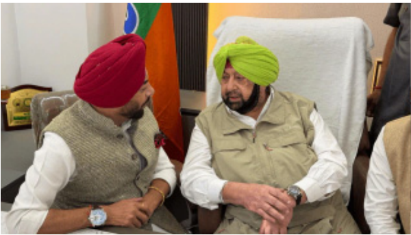
Oct 31

Punjab's former chief minister Capt Amarinder Singh Thursday said he had "never vowed to completely eradicate drugs from Punjab", but only to "break its back", and claimed that while all the gangsters were "put behind the bars" during his government, they are now "roaming free again." The veteran leader, who made a public appearance after months, sought to set the record straight on several issues, including his vow with Gutka Sahib (a Sikh holy scripture) in hand in 2015 that he will solve Punjab's drug issue within four weeks once voted to power.