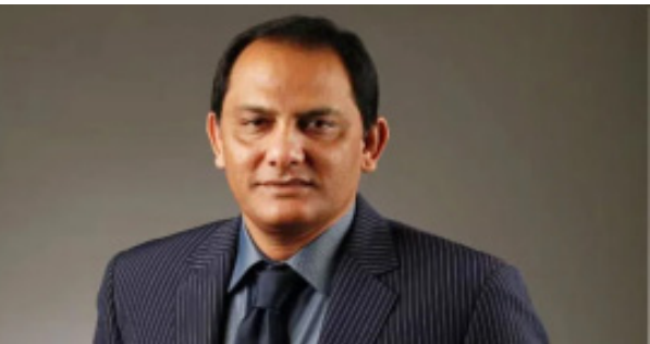
GNS News Agency, Nov 4 HYDERABAD: The Congress government on Tues-

day allocated the Minorities Welfare and Public Enterprises department to former cricketer Mohammed Azharuddin, who was inducted into the cabinet on October 31.There was suspense for three days over the portfolio allocation to the former cricketer. Apart from political circles, there was curiosity in Gandhi Bhavan also over his portfolio allocation. Drawing curtains to the uncertainty, the government allocated two portfolios to Azharuddin on Tuesday.The sudden decision of the Congress government to induct Azharuddin into the cabinet had drawn sharp criticism from different sections. Many criticised that his induction into the cabinet was appeasement politics to win the confidence of the Muslim community in the Jubilee Hills by-election.