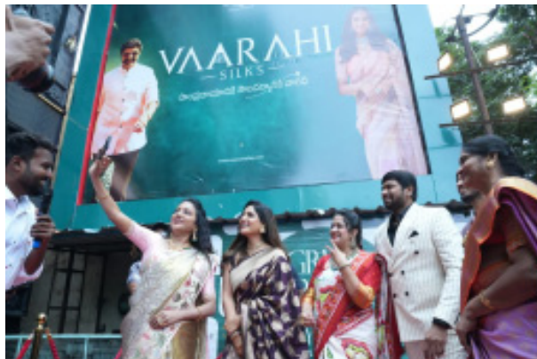
"Hyderabad, 23rd September 2025: "Vaarahi Silks, one of South India's most loved saree destinations, proudly announces the grand launch of its 4th store at Patny Centre,