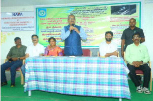
“Bhukya Ranjith naik,Bhadradri Kothagudem Bureau , September 17 ,Indian Chronicle:“Students can learn more effectively through digital education methods, observed Dis-