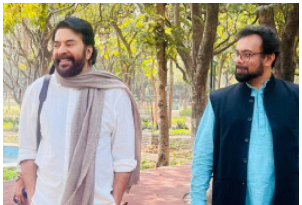
Malayalam superstar Mammootty's return to cinema has stirred excitement among fans and colleagues alike.