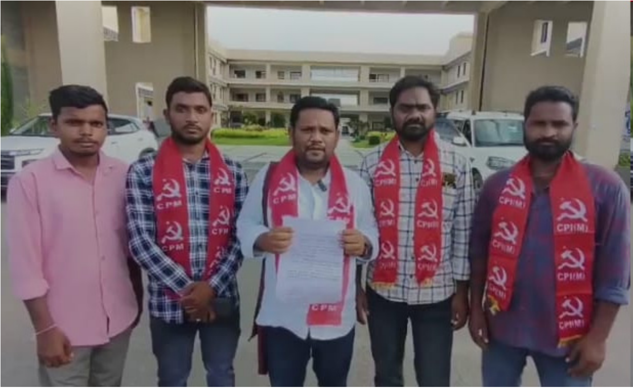
Kumrambheem, Asifabad district Reporter.Jade Srinivas. "Indian Chronicle" August,21.CPM district leaders""CPM district leaders have demanded that up to 50 acres of crops in Jaitpur and Borda villages have been damaged due to flood water after the gates of the Komaram

Bheem project in Wankidi mandal were lifted.