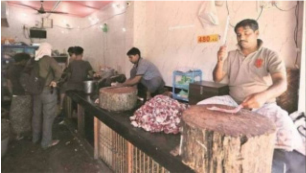
GNS News Agency, August 20