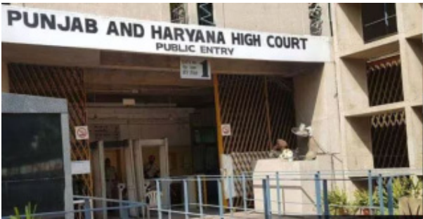
GNS News Agency, August 20

HC dismisses plea to switch MBBS admission from Punjab quota to Chandigarh pool The court noted that MBBS prospectus required all candidates to give an undertaking that they had not opted and claimed benefit of residence in any other State or UT other than Chandigarh. The Punjab and Haryana High Court has rejected a writ petition seeking permission for a medical aspirant to withdraw from the Punjab state quota and apply instead under the Chandigarh pool for MBBS admissions in the 2025 session.