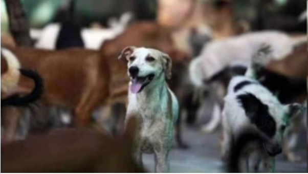
August 20

Communities think of neighbourhood dogs as family, and displacement and jailing of dogs is not scientific and has never worked, said PETA India, after the Supreme Court Monday directed the Delhi Government, civic bodies, and authorities of Noida, Gurgaon, and Ghaziabad to pick up stray dogs and move them to shelters. “According to a population survey conducted in 2022–23, Delhi has around 10 lakh community dogs, with less than half sterilised. Forced removal ... will cause uproar in communities that care deeply for them. It will also ultimately do nothing to curb the dog population, reduce rabies or prevent dog bite incidents,” PETA added.