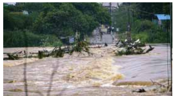
Around 51 districts in India are at a "very high" risk of floods, whereas 91 districts are at a "very high" risk of drought and 188 are at "high" risk.

An area is considered under the risk of drought hazard if precipitation systematically falls below the long-term