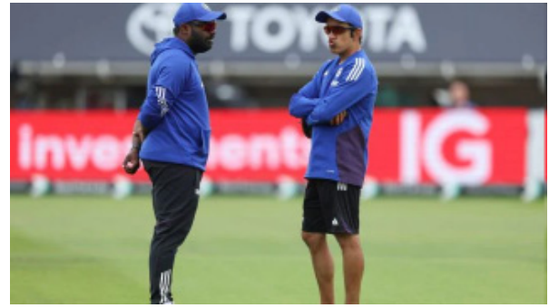
July 16

When India picked the playing XI for the second Test at Edgbaston, quite a few questions were raised by the cricket pundits. However, India managed to thrash England by 336 runs in the end. The changes made were that Jasprit Bumrah was rested after the loss in Leeds, which did come to sharp criticism, and apart from that, Washington Sundar and Nitish Kumar Reddy were brought into the side in place of Sai Sudharsan and Shardul Thakur. Gambhir’s former Kolkata Knight Riders teammate Manvinder Bisla slammed Gambhir’s critics after the result. “Before the Test: @GautamGambhir messed up the XI. After the win: @ShubmanGill era begins. Narratives change faster than