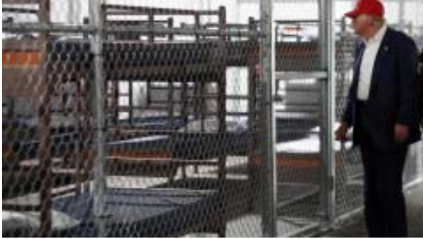
GNS News Agency, july10

President Donald Trump toured a new immigration detention centre surrounded by alligator-filled swamps in the Florida Everglades, suggesting it could be a model for future lockups nationwide as his administration races to expand the infrastructure necessary for increasing deportations.Mr. Trump said he'd like to see similar facilities in "really, many states" and raised the prospect of also deporting U.S. citizens. He even endorsed having Florida National Guard forces possibly serve as immigration judges to ensure migrants are ejected from the country even faster."Pretty soon, this facility will handle the most menacing migrants, some of the most vicious people on the planet," Mr. Trump said of the Florida site known as "Alligator Alcatraz."