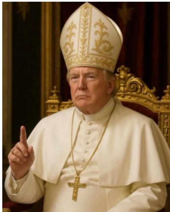
GNS News Agency, May 7 U.S. President Donald Trump posted a spoof picture of himself dressed as the pope on his Truth Social platform after joking that he would like to be the next Catholic pontiff. The president is seen in