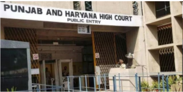
GNS News Agency,May 30