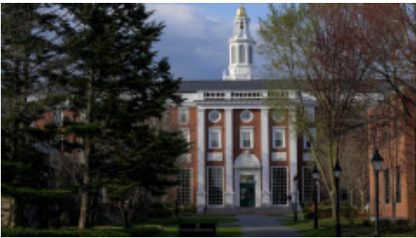
GNS News Agency, May 30

A federal judge on Friday (May 23, 2025) blocked the Trump administration from cutting off Harvard's enrolment of foreign students, an action the Ivy League school decried as unconstitutional retaliation for defying the White House's political demands. In its lawsuit filed earlier Friday (May 23, 2025) in federal court in Boston, Harvard said the government's action violates the First Amendment and will have an "immediate and devastating effect for Harvard and more than 7,000 visa holders."