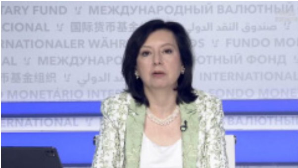
GNS News Agency, May 30