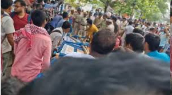
GNS News Agency,May 30