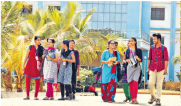
May 30