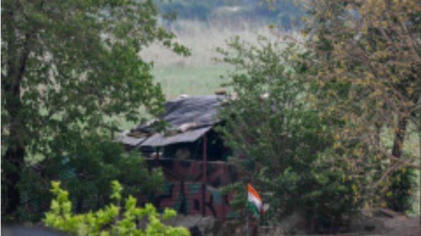
May 9

The Pahalgam terror attack (April 22) has put Delhi and Islamabad into a different trajectory from the past, and is one that should alert the entire strategic community. This was the first such incident on this scale targeting civilians since the Mumbai 2008 attacks. The barbarity in Pahalgam, segregating men from women, identifying them by religion and then executing them is aimed not just at terrorising Indians, and crushing a slowly reviving Kashmiri economy but also of instigating a communal rift in the rest of the country. Unlike the “fidayeen” attacks of the past, where terrorists were sent in as cannon fodder, to continue to kill until eliminated by security forces, this attack seemed more precise, with an exfiltration plan in place. While a deeper inquiry into the lapses that allowed the attack to take place and for the terrorists to leave unchallenged is awaited, the government has announced diplomatic measures, which include the suspension of the Indus Waters Treaty (IWT). It has also given the defence forces the green light to plan a military operation.