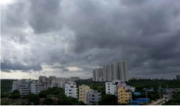
Jangaon, Siddipet, Yadadri Bhuvangiri, Rangareddy, Medchal Malkajigiri Rangareddy, Hyderabad, Medchal Malkajigiri, Vikarabad, Mahabubnagar, Nagarkurnool, Wanaparthi, Narayanpet and Jogulamba Gadwal.

GNS News Agency, April 30 Hyderabad: Amidst searing temperatures in the State, the Indian Meteorological Department (IMD) Hyderabad on Wednesday issued a thunderstorm warning accompanied by gusty winds over the next five days. However, an orange heat wave alert was also issued for 17 districts which are expected to experience temperatures between 41 degree Celsius and 44 degree Celsius.Between Tuesday and Wednesday, intense heat wave like conditions prevailed in most parts of Telangana. A day temperature of 45.2 degree Celsius was recorded at Adilabad and several parts of Jagtial, Nizamabad, Nirmal, Karimnagar and Peddapalli, recorded temperatures between 44 degree Celsius and 44.9 degree Celsius.In Hyderabad, the maximum temperature hovered between 41 degree Celsius and 41.9 degree Celsius. However, Hyderabad, Medchal-Malkajigiri and Rangareddy districts will get some reprieve due to thunderstorms and windy conditions.The five-day thunderstorms warning has been issued for Adilabad, Kumram Bheem Asifabad, Mancherial, Nirmal, Nizamabad, Jagtial, Rajanna Sirsilla, Karimnagar, Peddapalli, Jayashankar Bhupalapally, Mulugu, Bhadradi Kothagudem, Khammam, Nalgonda, Suryapet, Mahabubabad, Warangal, Hanamkonda,