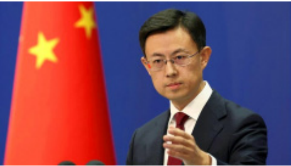
April 29

China said on Wednesday the door was "wide open" for trade talks with Washington, a day after U.S. President Donald Trump signalled the possibility of a "substantial" lowering of tariffs on Beijing. Bringing further relief to global markets spooked by his aggressive trade policies, Trump also said on Tuesday he had no intention of firing U.S. Federal Reserve Chair Jerome Powell. Since returning to the White House in January, Trump has imposed additional tariffs of 145% on many products from China. These include duties initially imposed over China's alleged role in the fentanyl supply chain and later over practices Washington deemed unfair. Beijing has responded with sweeping counter-tariffs of 125% on US goods, but reiterated on Wednesday that it was willing to engage in trade talks.