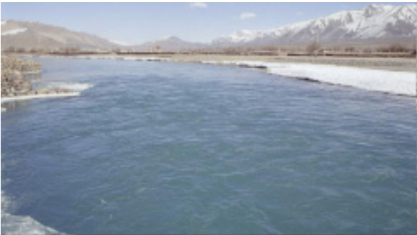
GNS News Agency, April 29

India has said the Indus Water Treaty (IWT) of 1960 with Pakistan will be held 'in abeyance' with immediate effect, until Islamabad credibly and irrevocably abjures its support for cross-border terrorism. The move on Wednesday (April 23, 2025) after the killing of 26 persons, including tourists, in Pahalgam in Jammu and Kashmir on Tuesday (April 23, 2025).