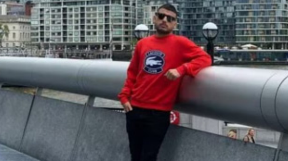
March 10