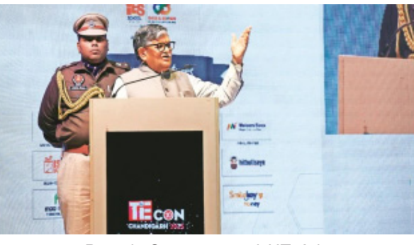
Punjab Governor and UT Administrator Gulab Chand Kataria underscored the pivotal role of TIECON in fostering a vibrant startup ecosystem in Punjab and Chandigarh

TIECON Chandigarh 2025 here on Thursday brought together innovative start-up founders who pitched ideas across diverse industries. Punjab Governor and UT Administrator Gulab Chand Kataria underscored the pivotal role of TIECON in fostering a vibrant startup ecosystem in Punjab and Chandigarh.