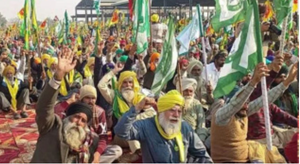
March 10

A day after the Samyukta Kisan Morcha's (SKM) Chandigarh Chalo call was thwarted by police action against farmers, the farmer union on Thursday lifted all 28 dharnas on various highways of Punjab and announced that farmers would stage protests outside the houses of all AAP MLAs in the state on March 10.