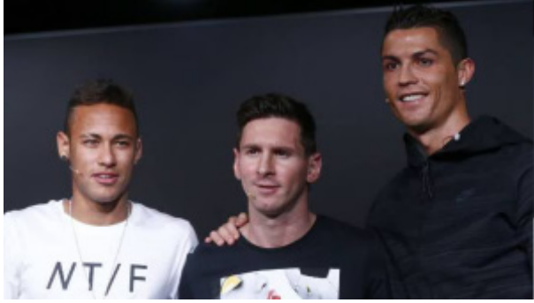
GNS News Agency, Feb 5