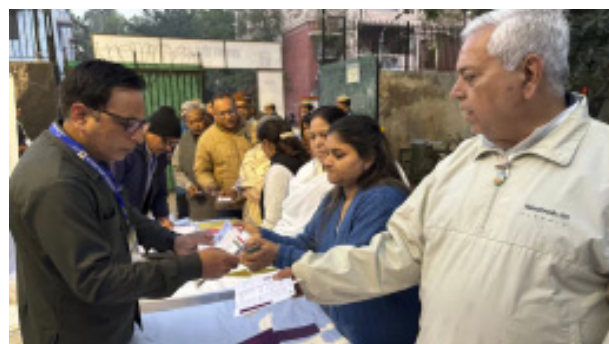
GNS News Agency, Feb 5

The national capital has recorded a voter turnout of