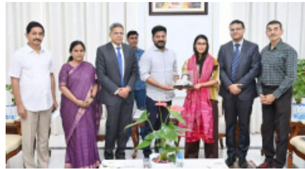
state government reaffirmed its support for initiatives that drive economic growth and technological excellence.

Hyderabad: Telangana Chief Minister A. Revanth Reddy participated in the inauguration of the HCL Tech KRC Campus at KRC Commerzone, Madhapur. The event marked a significant step in the state's efforts to strengthen its position as a leading hub for the IT sector. Speaking at the event, the Chief Minister highlighted Telangana's commitment to fostering technological advancements and attracting major investments. He lauded HCL Technologies for expanding its presence in Hyderabad and contributing to employment opportunities in the region. The newly inaugurated campus is expected to boost innovation and digital transformation while providing a world-class work environment for IT professionals. With Hyderabad continuing to emerge as a preferred destination for global tech firms, the