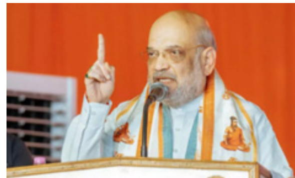
GNS News Agency, Feb 27

Bhopal: Prime Minister Narendra Modi has brought to fruition the noble dreams of 'Antyodaya,' a vision cherished by Nanaji Deshmukh - the great visionary of India in real sense, said Union Home and Cooperative Minister Amit Shah on Thursday in Chitrakoot, Madhya Pradesh. He said, in a mere decade, as many as six hundred million Indian citizens have now been provided homes, sanitation, sustenance, electricity, and gas connections. This remarkable achievement was extolled by the Union Home and Cooperative Minister, Amit Shah, during his visit to Chitrakoot, while addressing a function organised to commemorate the fifteenth anniversary of Bharat Ratna Nanaji Deshmukh. Home Minister, lauded Nanaji's visionary adoption of 'Ekam Manavwad,' a principle espoused by his compatriot, Deendayal Upadhyay. "As India strides forward with the ethos of 'Vasudhaiv Kutumbkam' (a Sanskrit phrase meaning, 'the world is one family), the world now gazes upon this great nation with admiration," he said. Nanaji Deshmukh's transformative concept of 'Gramodaya' has rendered Chitrakoot an exemplar of rural development, inspiring