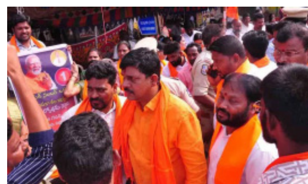
Feb 27

Khammam: Polling for the Warangal-Khammam-Nalgonda Teachers' MLC constituency election passed off peacefully in erstwhile Khammam district on Thursday, barring minor incidents. At the end of the polling, 93.03 per cent voting was recorded — of the 4,089 voters, as many as 3,804 cast their vote in Khammam district. In Kothagudem district, of the 2,022 voters, 1,859 cast their vote and the polling percentage was 91.94. Police had to intervene as a clash ensued among the supporters of TPUS, TSUTF and PRTU candidates over the display of flex banners at Ricob Bazar polling station under the two-town police station limits in Khammam city.