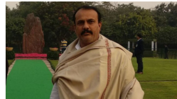
Feb 19