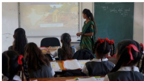
GNS News Agency, Feb 19

Emphasising the effective utilisation of the prescribed 220 teaching days in government schools, the Himachal Pradesh government Saturday issued its annual academic calendar for 2025-26, limiting the duration of the annual sports meet at different levels. Additionally, the annual academic calendar focuses on curbing the practice of sending school students to participate in various functions organised by government departments and NGOs.