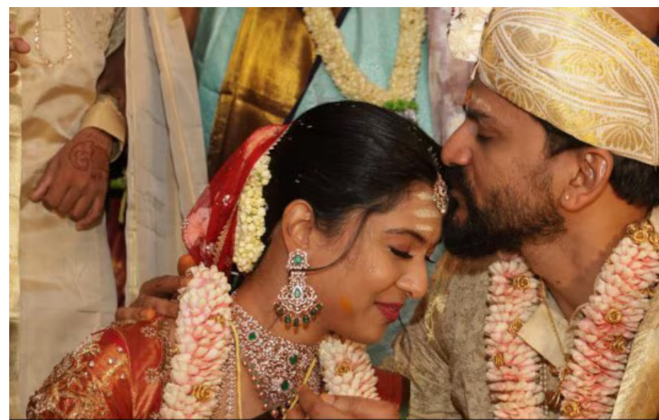
Sarja and Shradhaa Srinath, among others. The wedding

The ceremony took place at the Exhibition Grounds in Mysore, where a splendid replica of the Chamundeshwari temple was constructed. Some of the celebrities who were part of the lavish event were actors Shivarajkumar, Ramya, Upendra, Priyanka, Rakshita, Prem, Sruthi Hariharan, Meghana Raj, Sapthami Gowda, Dhruva