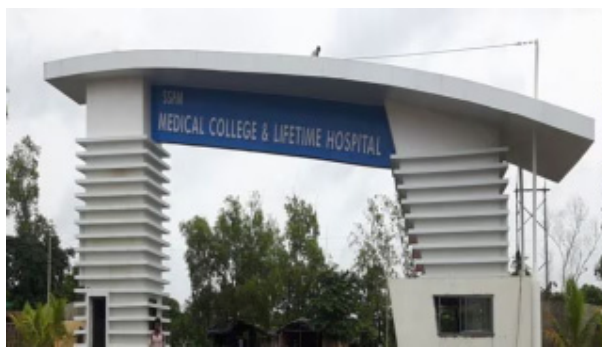
GNS News Agency, Jan 8