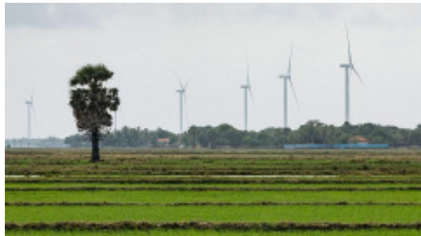
GNS News Agency, Jan 29

developed for doing this. Using this tech, one NK cell can grow 600 to 1,000 times over a 15-day period, according to Pai. These cells can then be cryopreserved and thawed when needed without loss of functionality, he says. While developing genetically modified NK cells from healthy donors helps to make the treatment more affordable and off the shelf, Pai admits that there are certain flip-sides to it. A major one is rejection of the cells by the patient's body. "If you are giving back a patient's blood cells to the same body, you don't expect too much rejection. But when you are giving the blood cells of a healthy person, it could be perceived as foreign by the patient's body. You need to see how the body reacts to it, whether the cells are creating any safety issues and so on."