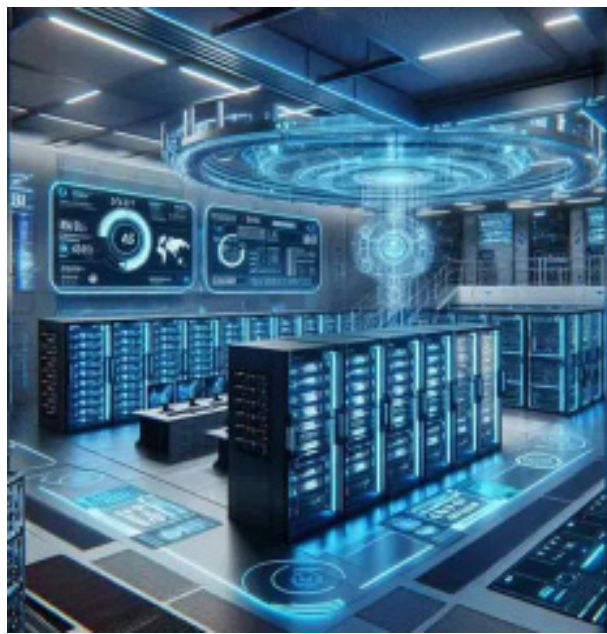
GNS News Agency, Jan 29

Hyderabad: Omi artificial intelligence (AI)-enabled wearable, demonstrated by CES 2025, is being marketed as a breakthrough device that will help enhance productivity and automate everyday activity. Priced at Rs 7,640 (approximately $89), the device is available for pre-order and is set to ship in Q2 of 2025. The wearable is designed by San Francisco based startup Based Hardware and can be worn in several forms. It can be worn as a necklace (which reacts to the voice command such as "Hey Omi" or attached to the back of your head with medical tape (providing an "brain interface" reading the brain waves and analyzing information without verbalization and speech).