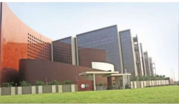
GNS News Agency, Jan 20

SuratThe numbers have had a direct impact on Surat with eight out of every 10 diamonds in the world polished in the Gujarat city in around 5,000 small, medium and big diamond factories. For the second consecutive year, the Diwali vacation in the diamond factories has exceeded 21 days. With the industry facing an unprecedented recession, diamond traders have had to resort to all sorts of measures to cut their losses. One such step is to extend the Diwali holidays of diamond workers. Usually the diamond factories close for around three weeks during Diwali, but last year, after the Ukraine-Russia war, the industry workers got a 36-day vacation, the longest till then. "The global conditions have affected the diamond cutting and polishing industry of Surat. Going by convention, when Diwali vacation used to be of 21 days, the factories should have become functional on November 15. But keeping in mind the present conditions, we will fully start operating only from the first week of December," said Surat Diamond Association (SDA) president Jagdish Khunt.