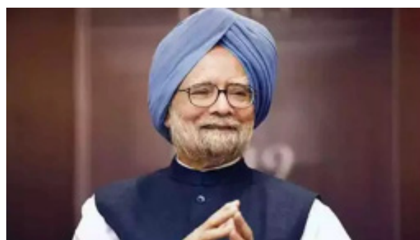
GNS News Agency, Dec 27