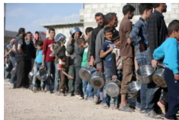
look at foreign aid.

The aid cuts Trump sought in his first term didn't pass Congress, which controls such spending. Senator Lindsey Graham, a South Carolina Republican and close Trump ally on many issues, will chair the Senate committee that oversees the budget. In 2019, he called "insane" and "short-sighted" a Trump proposal to cut the budget for foreign aid and diplomacy by 23%. Graham, Vought, Rubio and Musk did not respond to questions for this report.